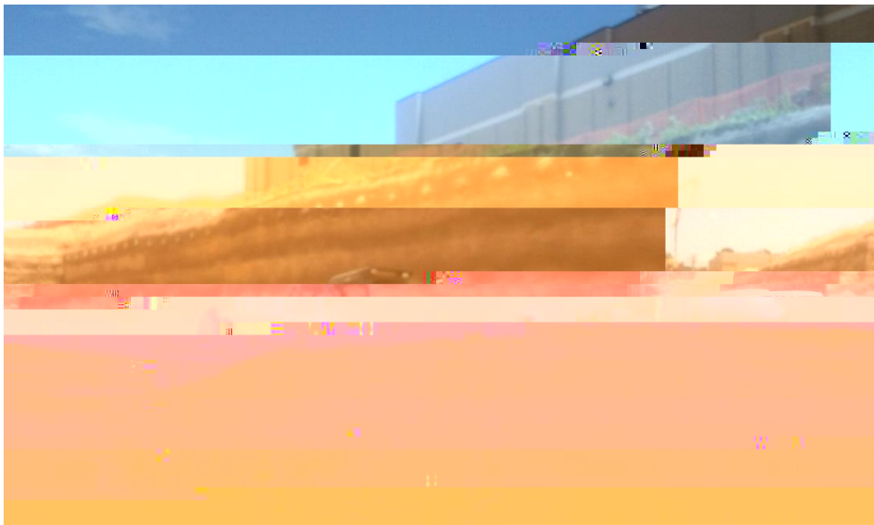
Soil Wall construction is progressive